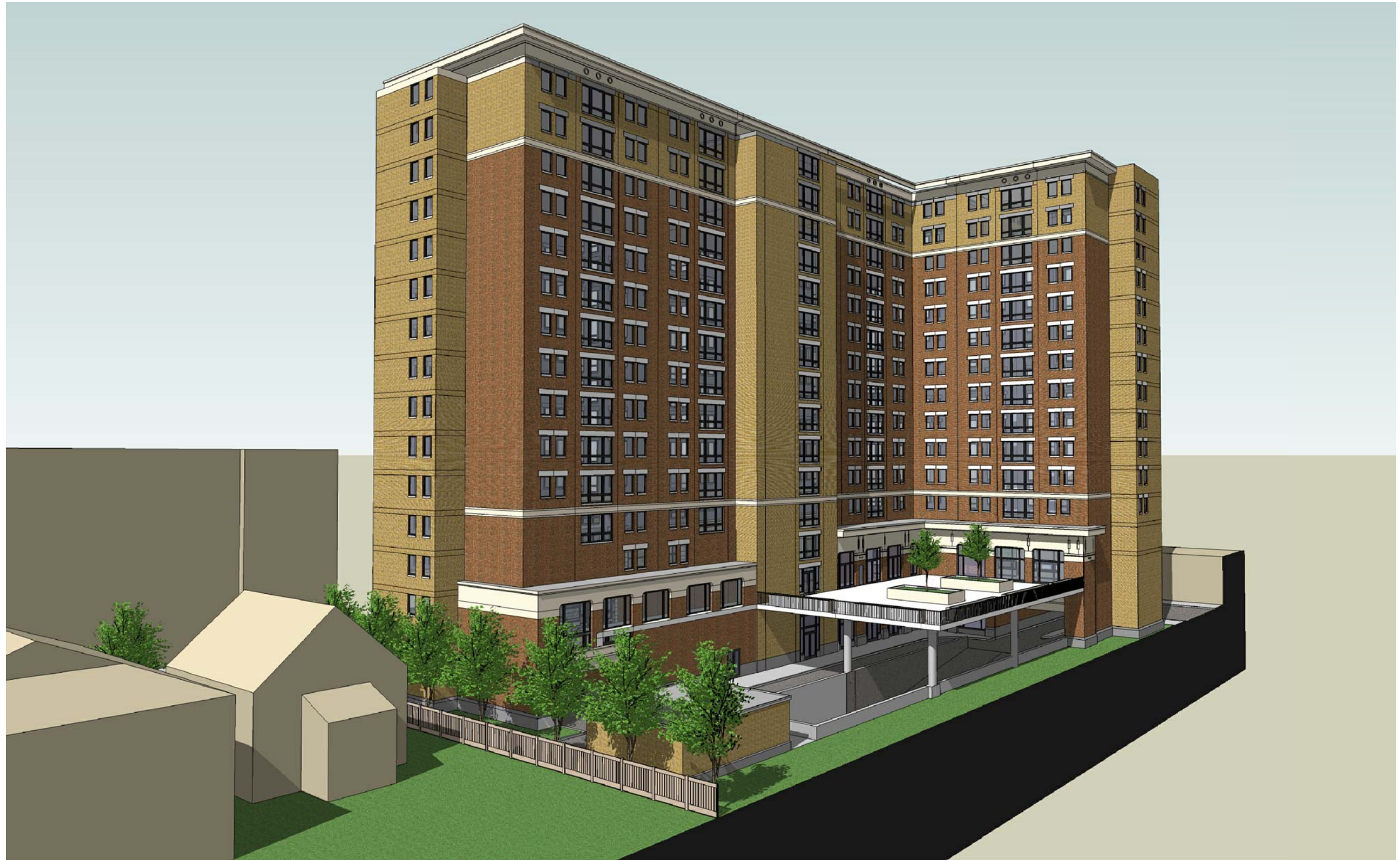
CONCEPTUAL VIEW LOOKING NORTHWEST - AS PROPOSED SITE PLAN REDUCTION