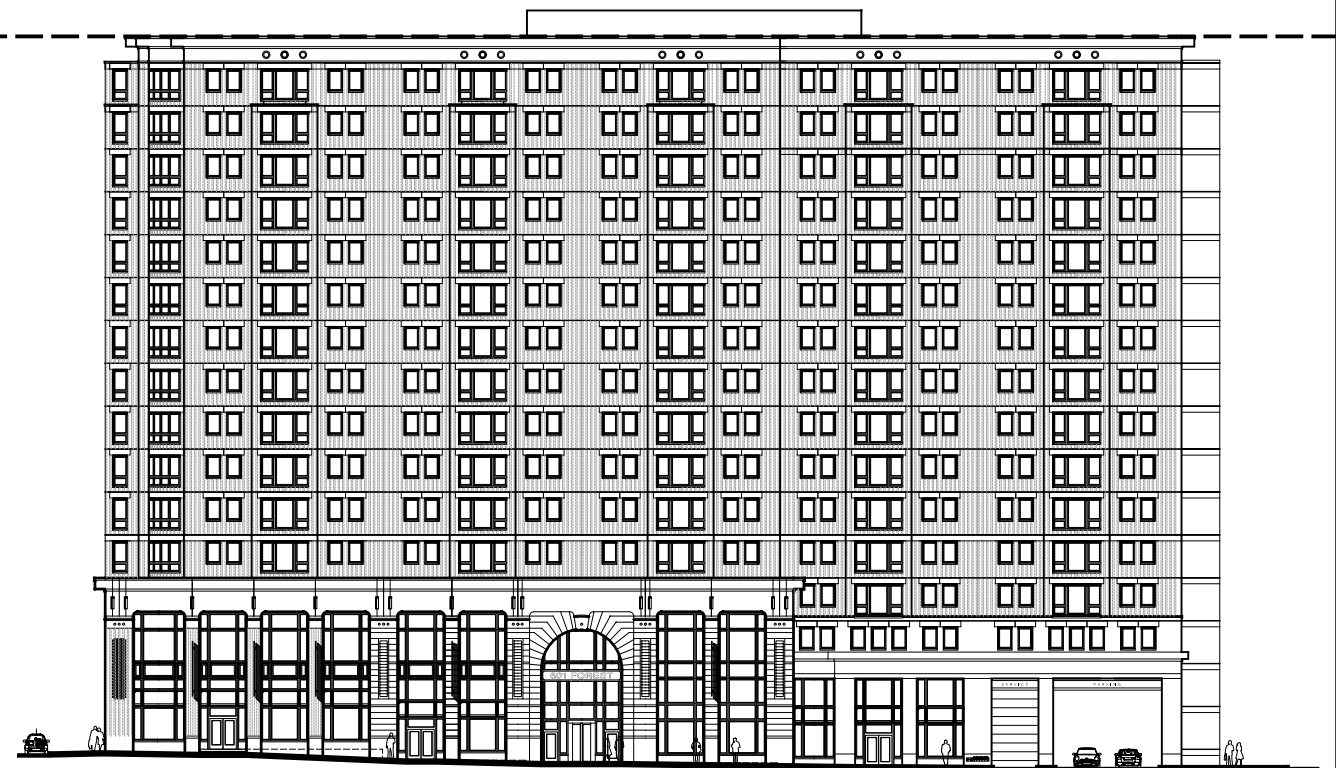
CONCEPTUAL WEST ELEVATION - AS PROPOSED SITE PLAN REDUCTION