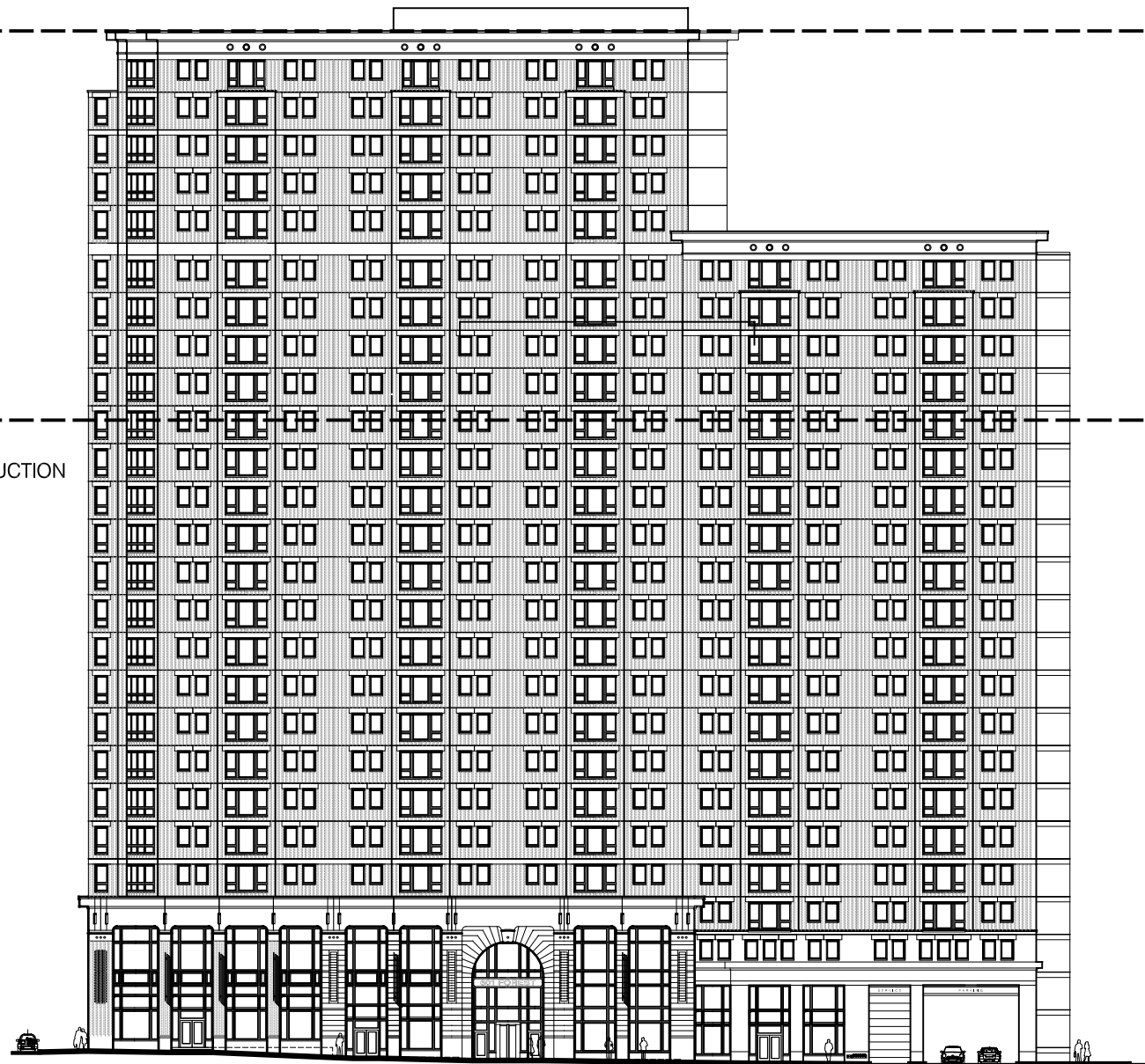
CONCEPTUAL WEST ELEVATION - AS SUBMITTED

AS PROPOSED SITE PLAN REDUCTION OCT. 6, 2008