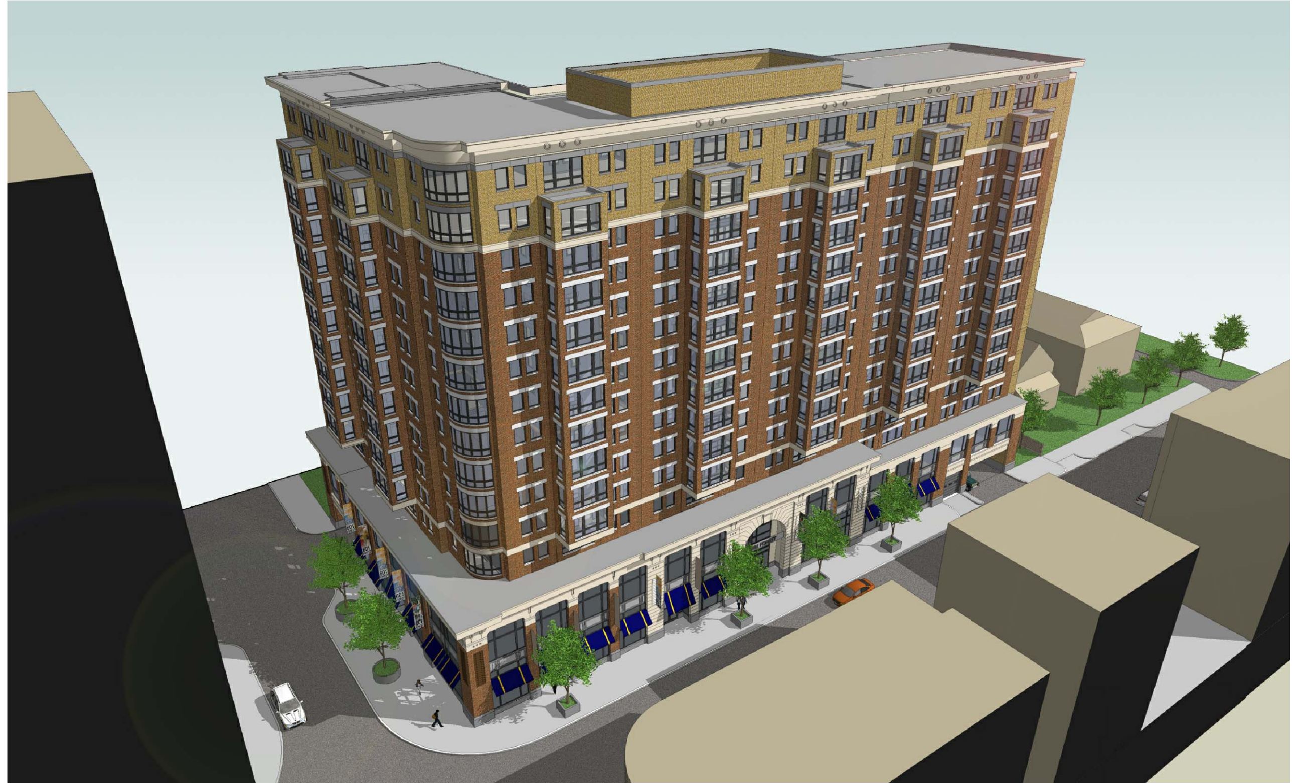
CONCEPTUAL VIEW LOOKING SOUTHEAST - AS PROPOSED SITE PLAN REDUCTION