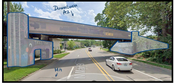
Future project location on N. Main Street