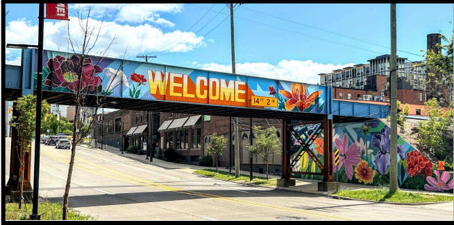
Completed Project on Huron Street