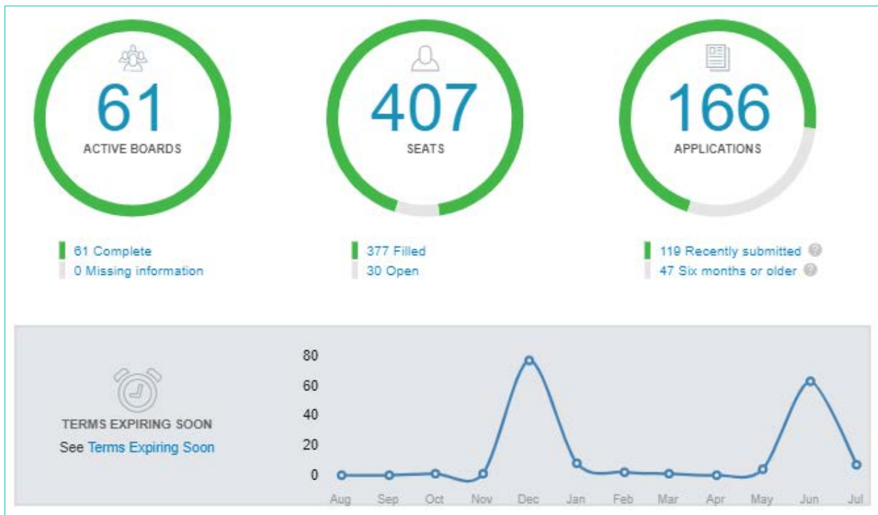
(Boards and Commissions Dashboard)

The Clerk's Office also streamlined the boards and commissions application process, incorporating new technology that allowed online submission of application materials by the public and provided the Mayor and Members of the City Council real-time access to the 149 applications submitted for consideration this fiscal year. This change in process combined with new emphasis on tracking and sharing vacancy information reduced the vacancy rate on boards and commission by a third from 11.8% in FY18 to 7.86% at the end of FY19.