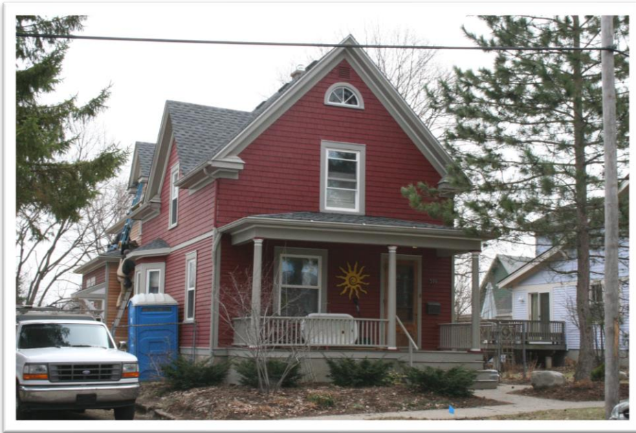
519 Fourth Street (2008 Survey Photos)