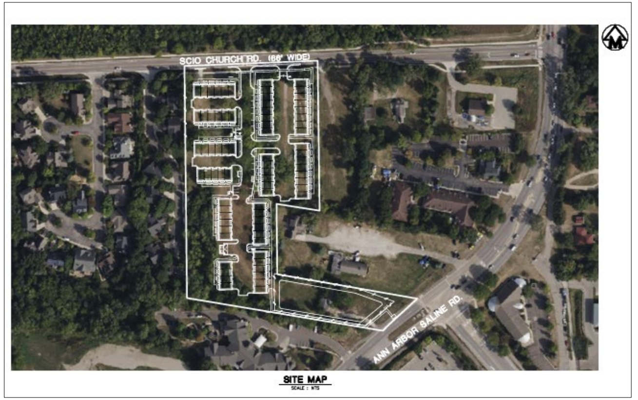
Figure 1 Existing Condition with site plan overlay