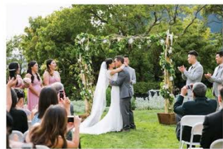
KAISER CENTER ROOF GARDEN OAKLAND, CA 1960 5-STORY PARKING DECK FIRST POST-WAR ROOF GARDEN IN U.S. 3.5 AC. W/REFLECTING POND & FOUNTAINS WOODEN BRIDGE, SEATING, SHRUBS, HERBACEOUS PLANTS, 42 MATURE TREES

FOR MORE INFO: https://www.tcf.org/landscapes/kaiser-center-roof-garden