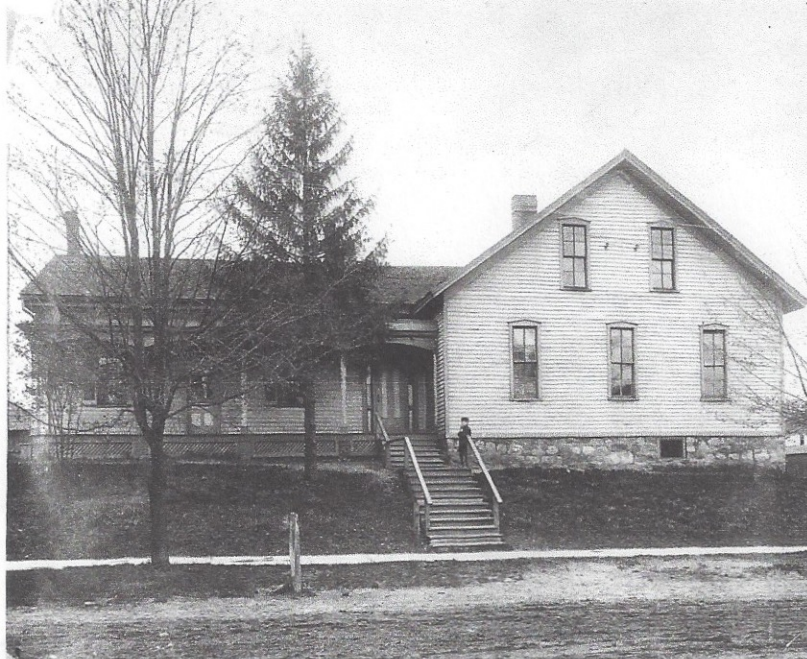
Left: "Old " Bethlehem School" (Old German School)

"In 1873 the German-language school on First St enrolled 121 pupils. German institutions and language survived for generations in Ann Arbor --but were largely swept away during the anti-German hysteria of the First World War."