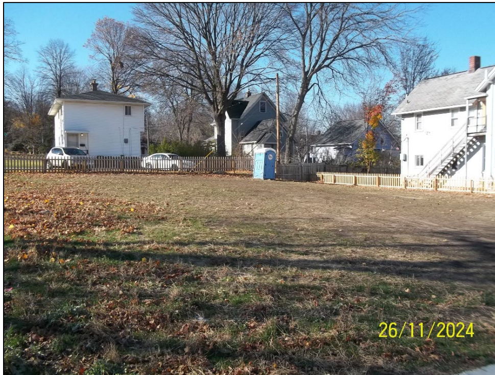
Figure 2: November 2024 staff photo of 630 South Ashley Street (looking northwest)