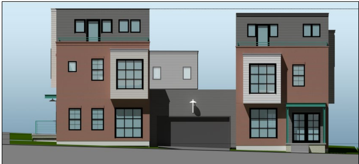
Figure 3: Rendering of the two single-family houses and garage between them (looking west from South Ashley Street)