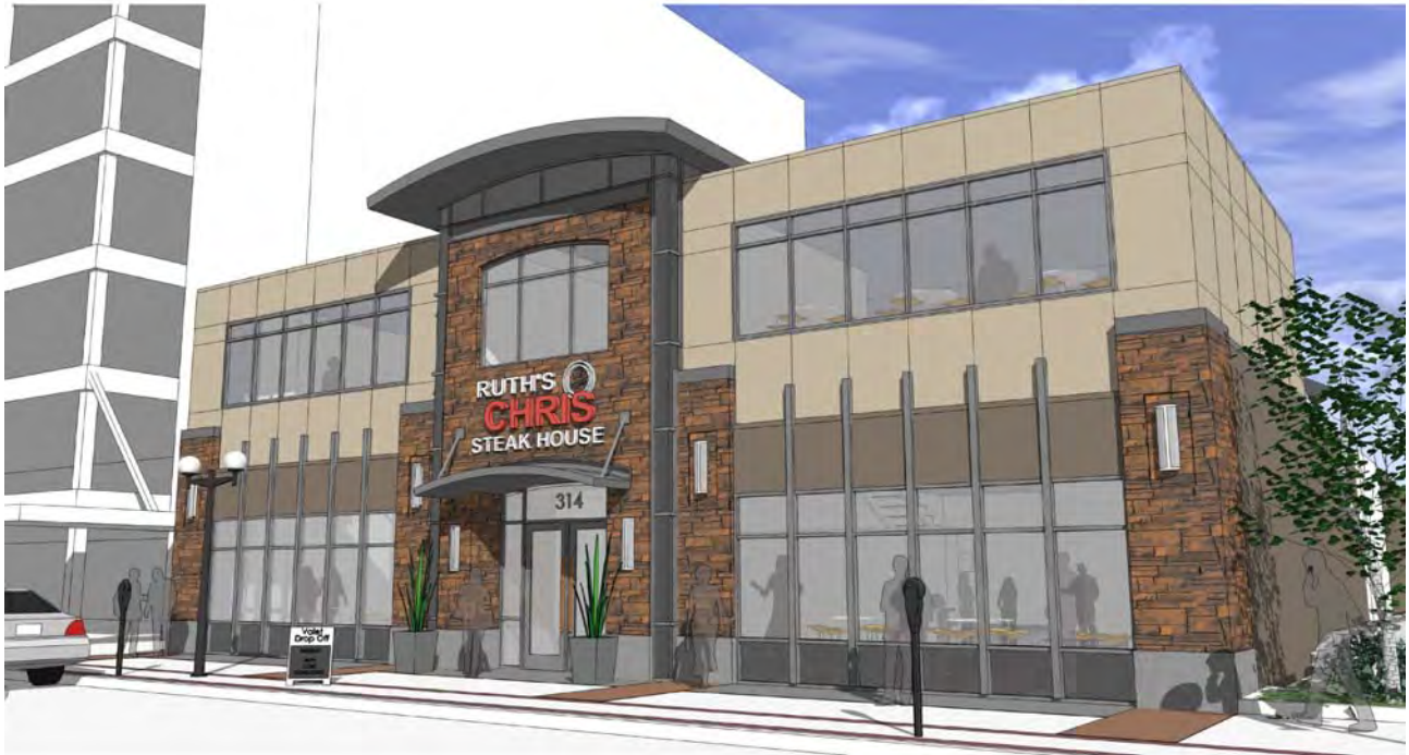
Proposed Ruth's Chris Steak House