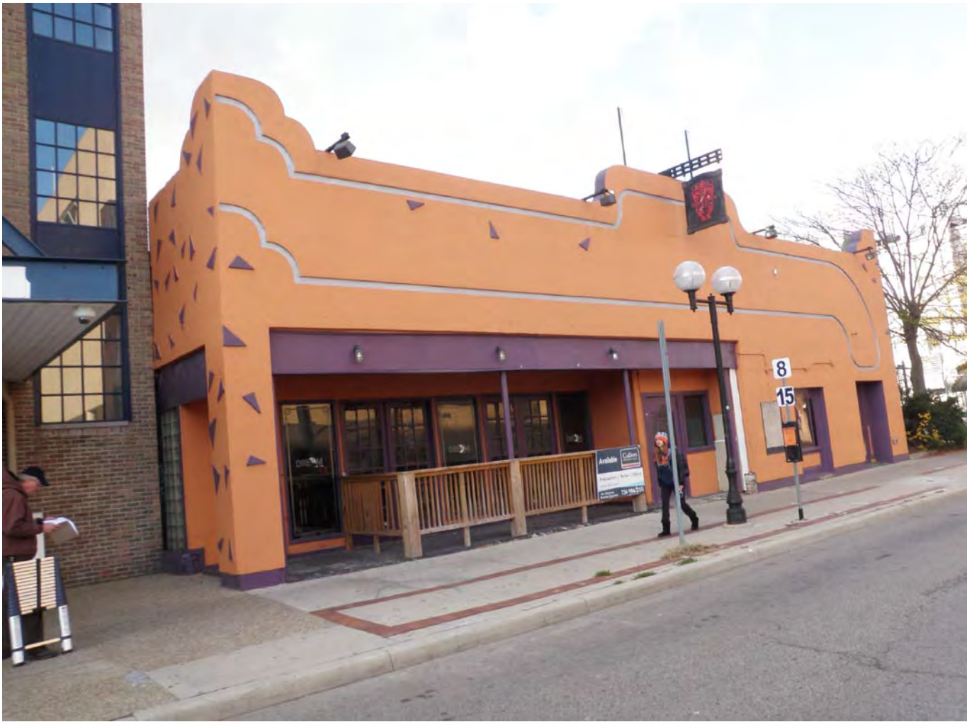
Existing 314 S. Fourth Street