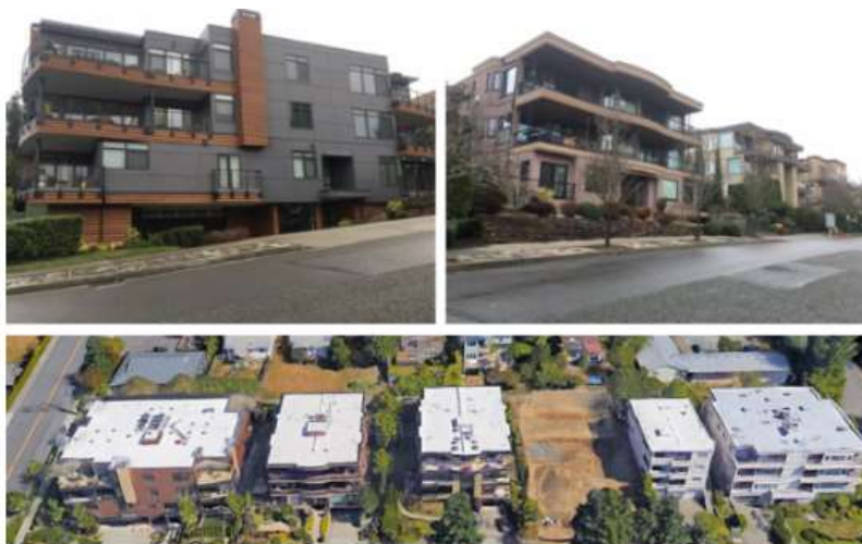
Figure 5. 27 Dwelling Units Per Acre (Net)

See: https://www.theurbanist.org/2017/05/04/visualizing-compatible-density/