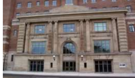
Figure 3. UofM North Quadrangle and entrance to the Department of Human-Computer Interaction, with the Carnegie Library facade retained.