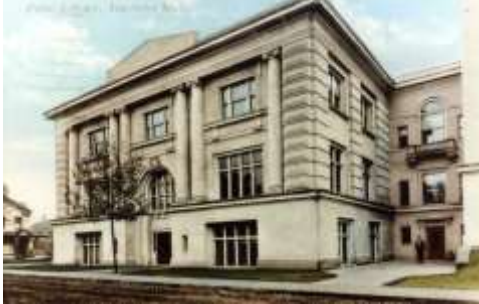
Figure 2. Ann Arbor Carnegie Library and High School (portion), 1907

The AADL system is augmented, based on: (1) the heritage of US libraries going back to Ben Franklin who innovated on US libraries for community access to books the average person could not afford, improving literacy; and (2) Andrew Carnegie who viewed libraries as a key engine for economic development, and financed the first Ann Arbor library on Huron near State Street after the City Council agreed to fund its operation.