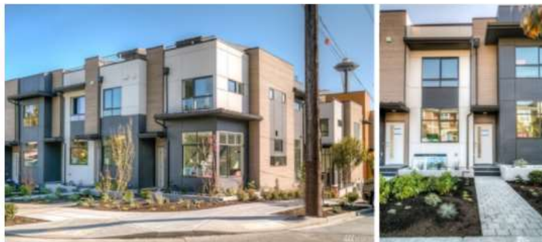
Figure 6. 44 Dwelling Units Per Acre (Net)

Notable features: Single and double-single family lots redeveloped with condominiums. Each building contains between three and seven units and has front-loaded parking at the street level beneath the dwelling units. All are built within a strict 30-foot height limit; hence, the flat roofs.