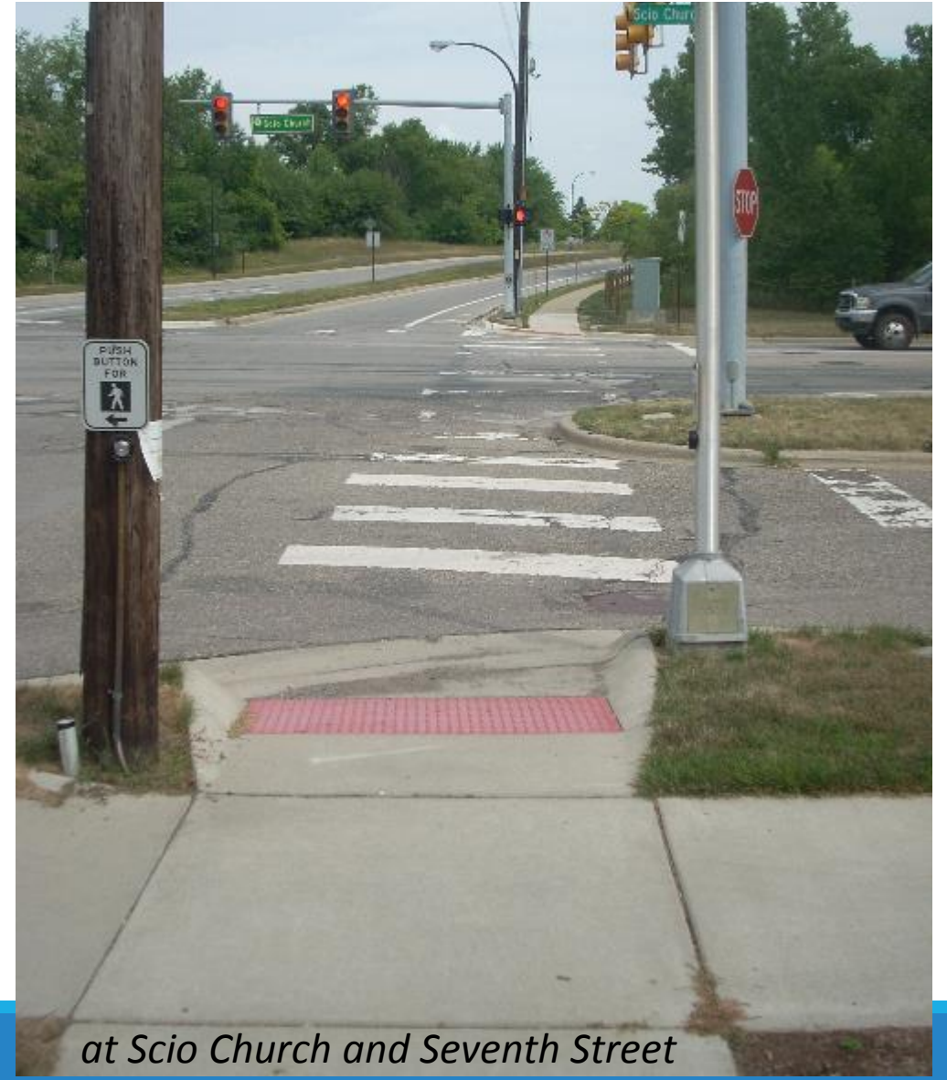
at Scio Church and Seventh Street