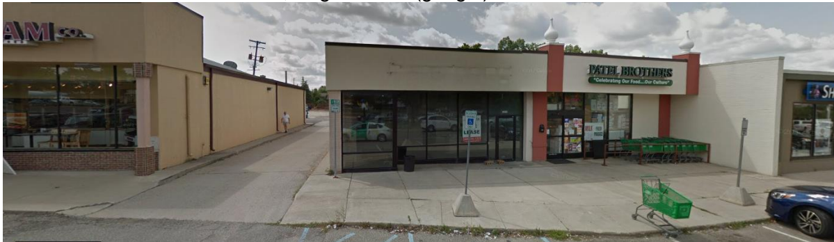
Front of 3430 Washtenaw Ave., August 2017 (google)

City Attorney's Office Systems Planning File No. SEU18-025