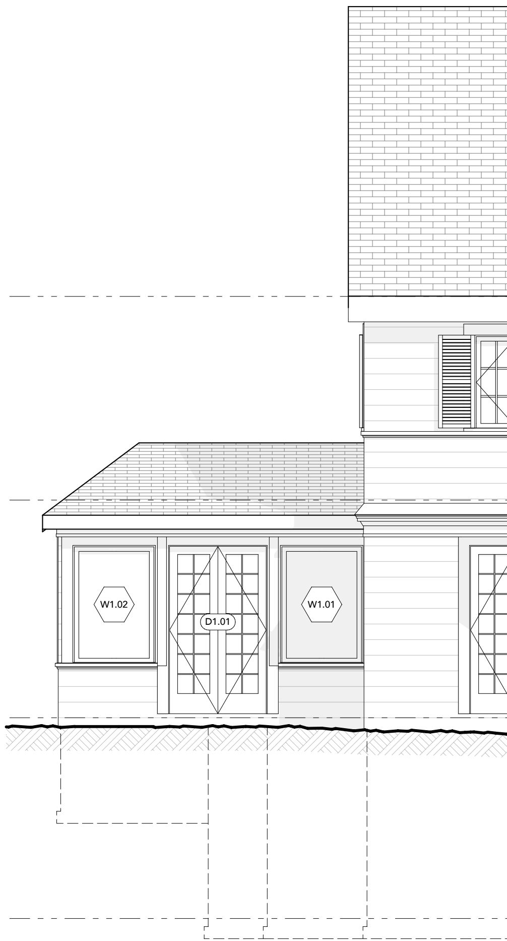
West Exterior Elevation