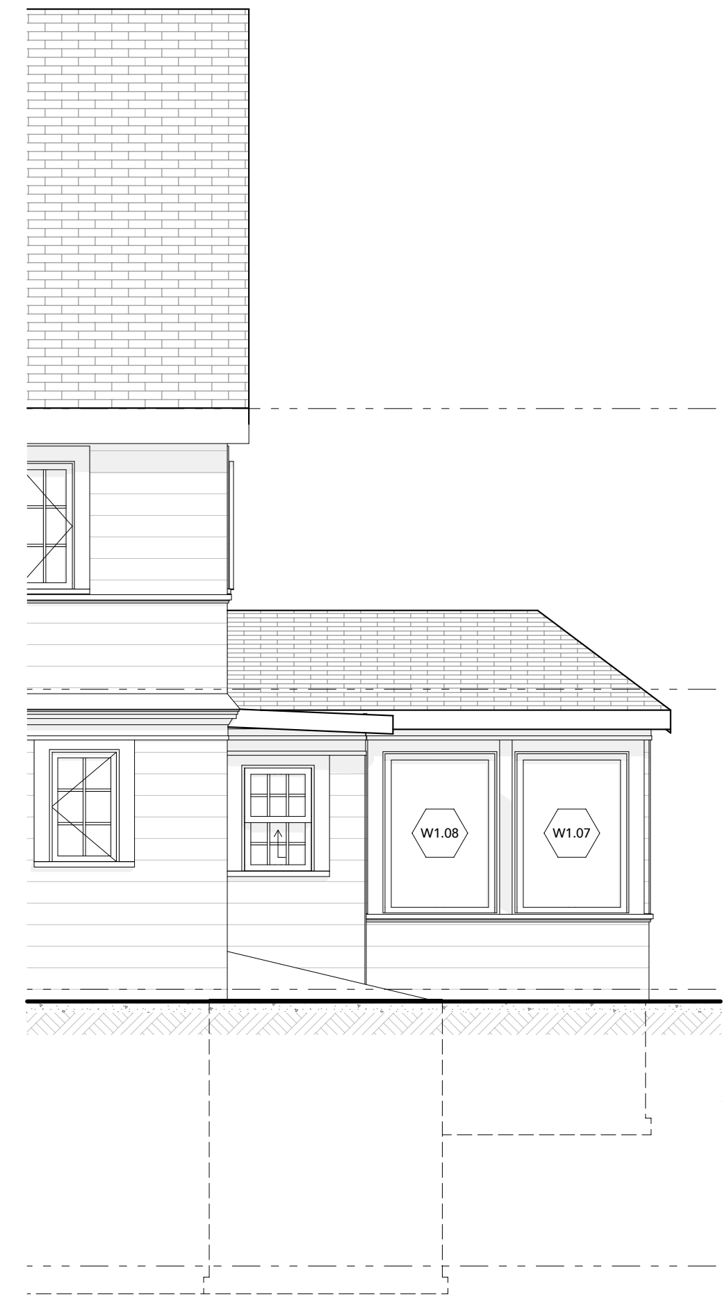
East Exterior Elevation