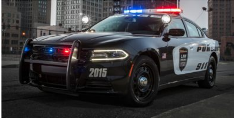
[Fleet] 2018 Dodge Charger (LDDE48) Police RWD