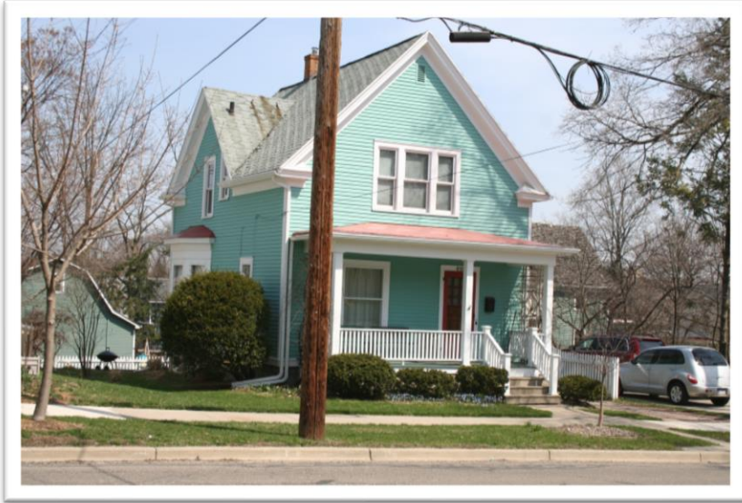
610 W Madison Street (2008 Survey Photo)