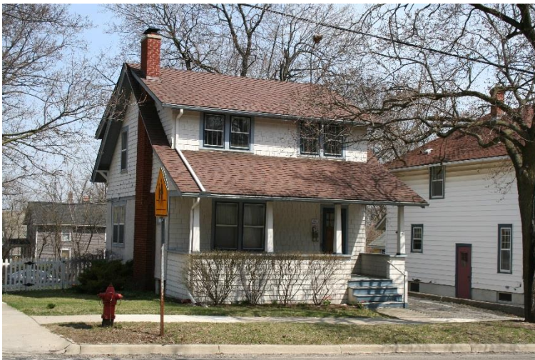
616 W Madison Street (2008 Survey Photos)

ATTACHMENTS: application, drawings, photos