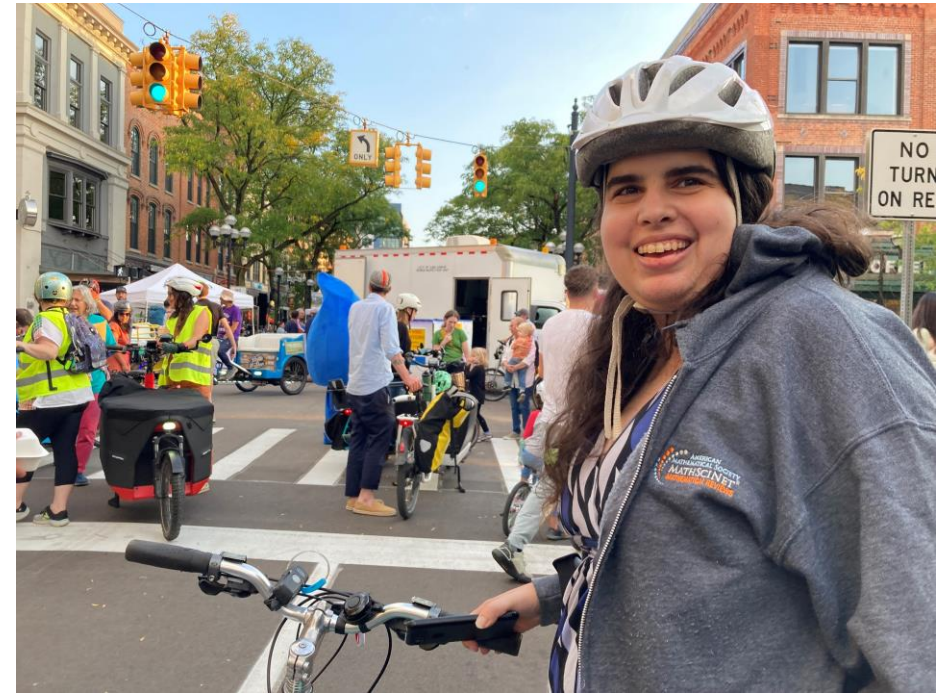
Mathematical Reviews joined the bike parade during Ann Arbor's Green Fair.