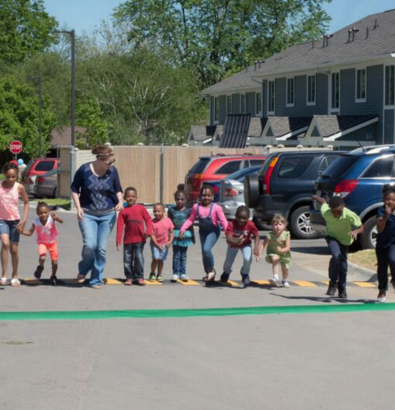
Open House West Arbor – Ribbon Running