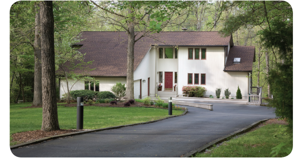
An alternative sealcoat: If sealcoating cannot be avoided, asphalt-based sealcoats are an alternative with 1/1000th the PAH concentration of coal tar-based sealcoats.

Studies show 50-75% of all PAHs found in sediments within the Great Lakes region come from coal tar sealcoat.