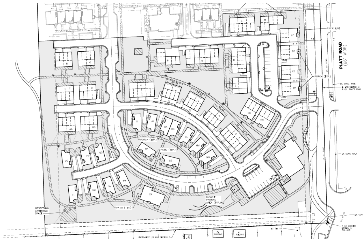
Figure 3 - South Site Plan (Thrive)