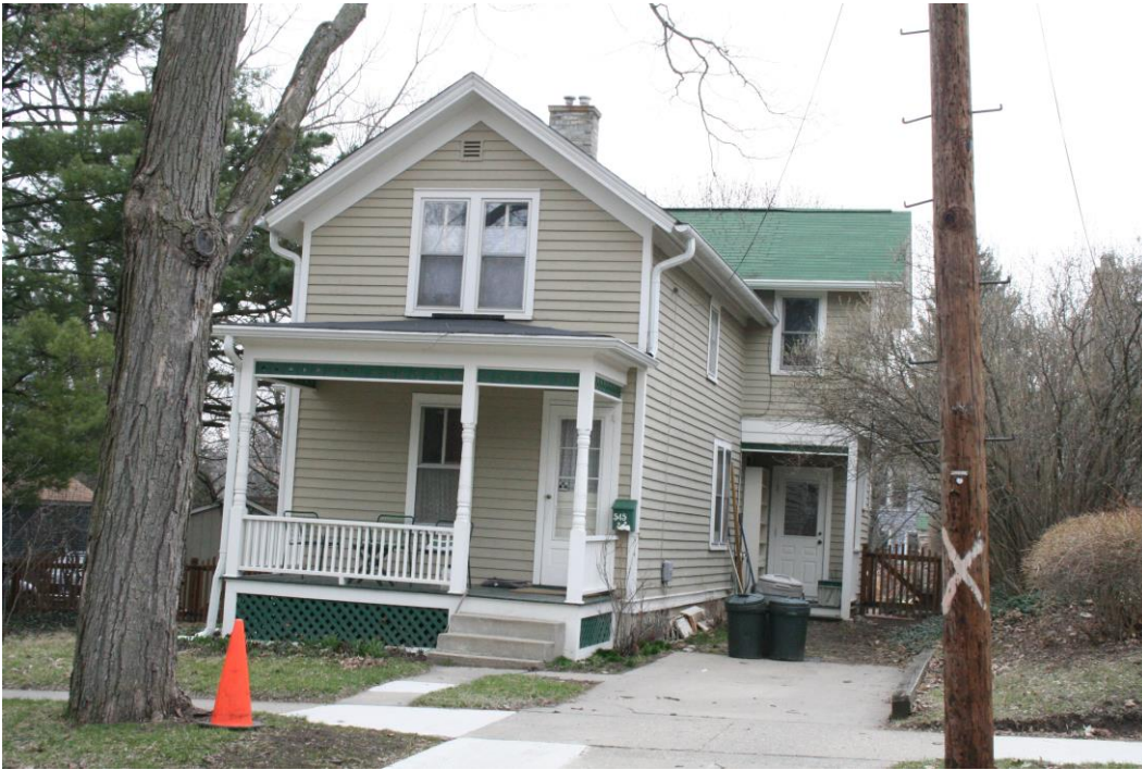
545 Sixth Street (2008 Survey Photo)