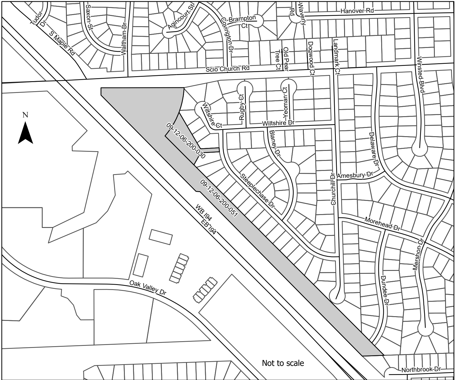
EXHIBIT A PARENT PARCEL DESCRIPTIONS

PARCEL 09-12-06-200-030, AKA CHURCHILL DOWNS PARK