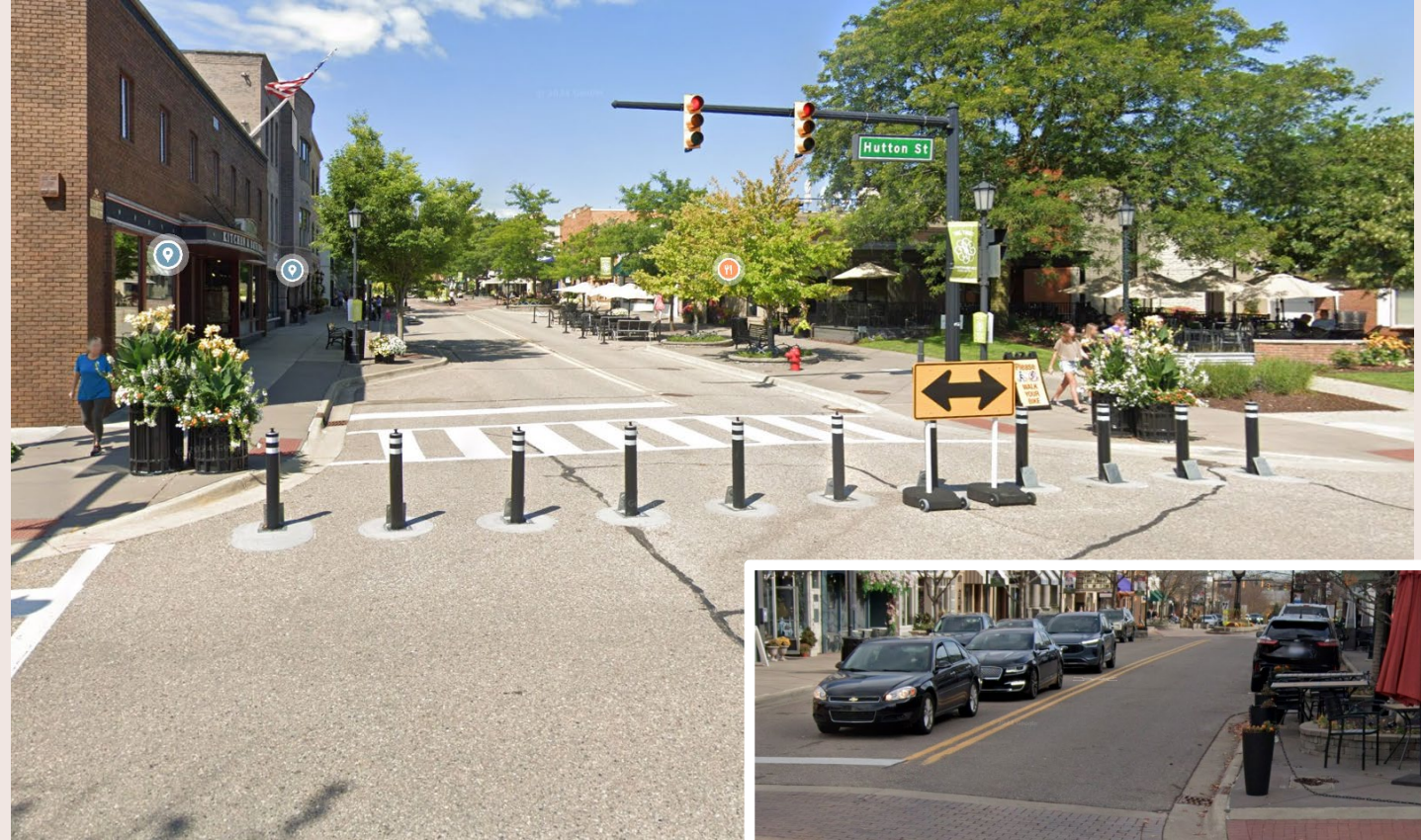
Bollards on Main St. in Northville, MI in deployed and undeployed condition