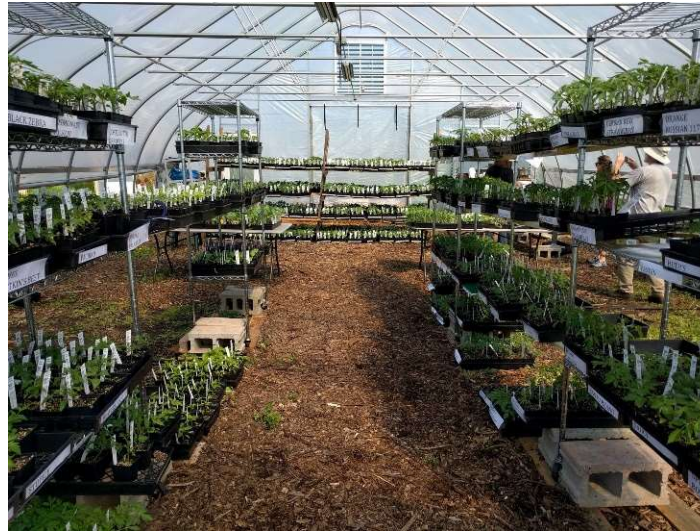
Heirloom Plant Sale