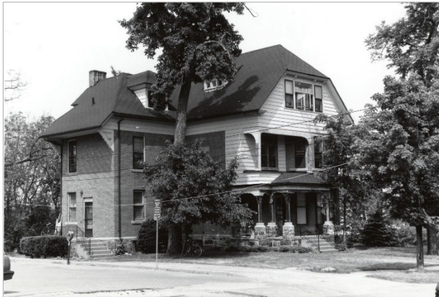
1886 Wirt & Mary Cornwell House

Originally platted in 1848, by 1900 Cornwell Place was lined with mansions that housed families, fraternities, and boarders. The most famous was the Wirt & Mary Cornwell house at 1009, built in 1886. The University of Michigan gradually acquired and demolished the houses for parking, keeping only the former St. Joseph's Sanitarium. The Cornwell house was the final structure, demolished in 2023.