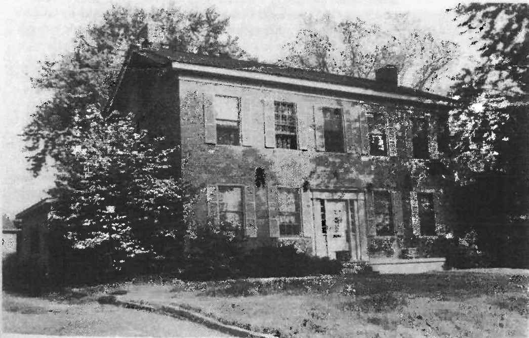
Photo Date: 06/01/92 Roll: -0- Frame: -0

First Map: 1856 County map First City Directory: 1878 Architect: Unknown Builder: Josiah Beckley Notes: Historic Buildings page 149