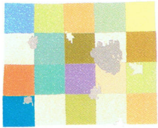
Washtenaw Area Transportation Study Transportation Profile 2006

WATS has recently completed two publications which are now available. Both the Washtenaw County 2006 Transportation Profile , and The Transit Plan for Washtenaw County , were approved by the WATS Policy Committee on February 20th.