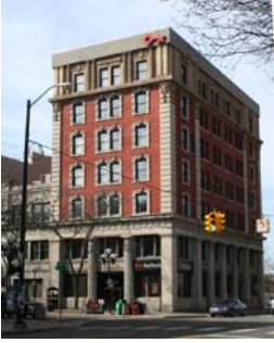
The Glazier Building at 100 South Main had its historic cornice restored in 2007, with stunning results.