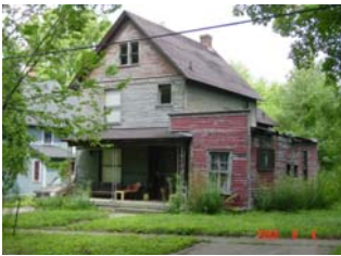
An application to demolish this Old West Side building was denied. New owners were given a Certificate of Appropriateness to rehabilitate the house (see below).

A total of 182 applications were received by the Commission in 2007. The Historic District Commission has delegated a number of minor activities to staff to approve on their behalf, and 127 of those applications received Certificates of Appropriateness from staff. Examples of some of the thirty kinds of work that may be approved by staff, if the work is appropriate, include: