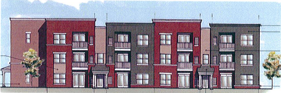
New Construction White/ State/Henry