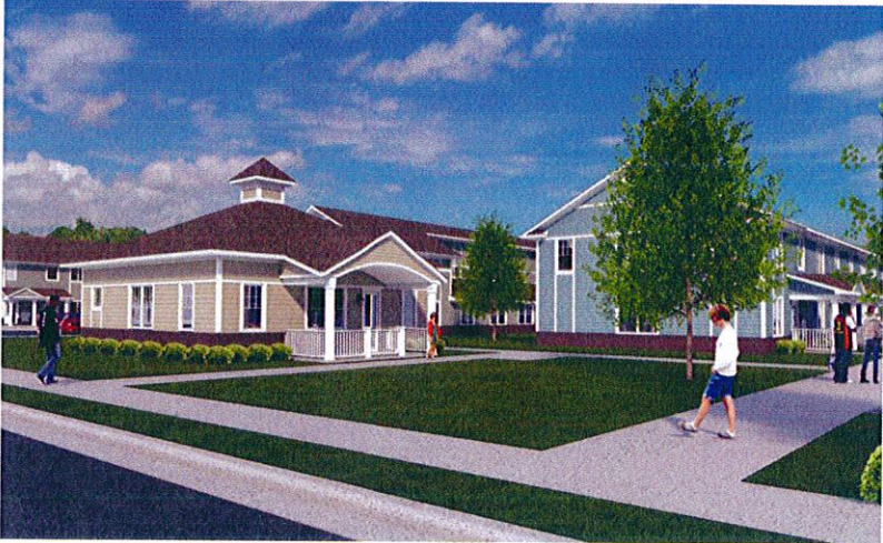
New Construction Platt Road