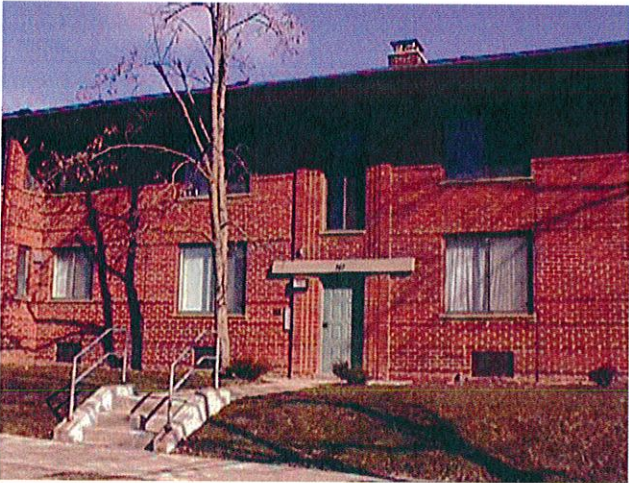
Existing White/State/Henry to be demolished