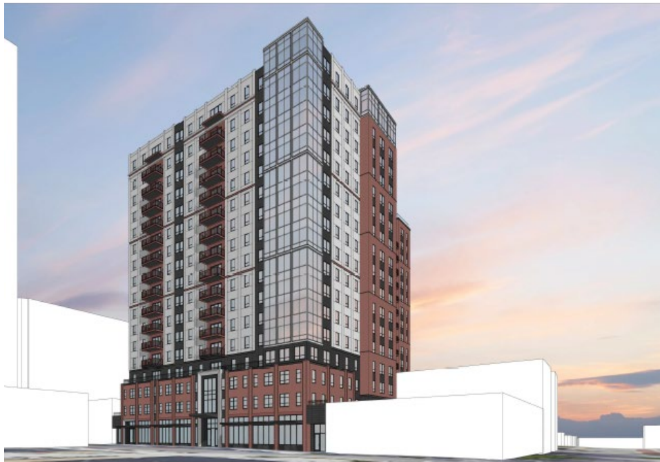
ANN ARBOR GALLERIA 1208 SOUTH UNIVERSITY AVE

PROPOSED PROJECT: The proposed concept includes 211 residential units, 2,000 square feet of retail, and residential amenities including a rooftop pool, lounge, and fitness room. The residential units will be a size mix from studio to six bedrooms and will contain a total of 673 bedrooms. The building is proposed to be 17 stories and 195 feet tall. There will be 34 off-street parking spaces are proposed at grade underneath the building and accessed from the alley on the south side of the site. The ground floor will include the retail space, lobby, 120 space bike room and leasing office. There will also be a designated mail room and package pickup location on the ground floor.