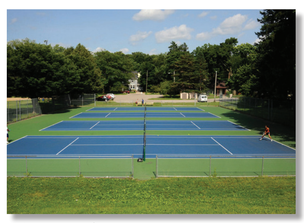
Tennis courts at Burns Park.