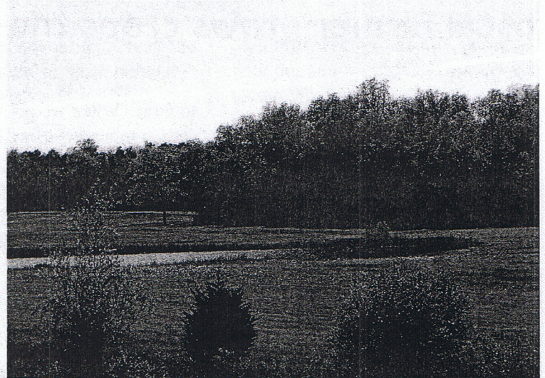
Wetlands, woodlands and fields at the Meyer Nature Preserve in Superior Township.

In August of 2008, the Washtenaw County Parks and Recreation Commission (WCPARC) became the owner of 139 acres in Superior Township, Washtenaw County. The preserve has since been named the Meyer Preserve to acknowledge the family which long held land in the Township. The 139 acres consists of two parcels on Prospect Road at the intersection of Vreeland Road, a 55 acre parcel located northeast of the intersection and an 84 acre parcel to the southwest. The preserve consists mainly of open agricultural land, with about 45 acres of valuable woods and wetlands, and makes a significant contribution to the two mile long Superior Township Greenway.