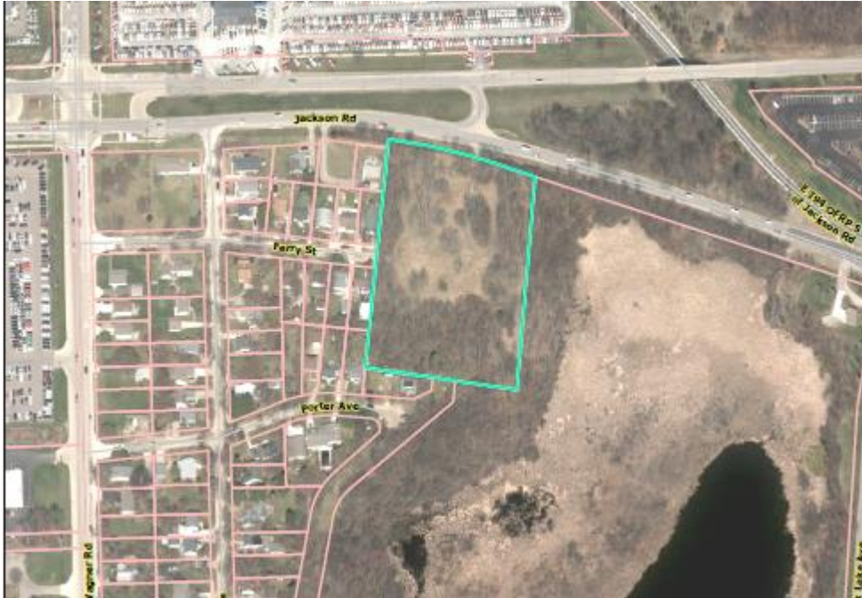
Figure 1: Existing Conditions (2015)

Existing Conditions – The site is currently vacant, one single-family home occupied the site and was demolished in 2011.