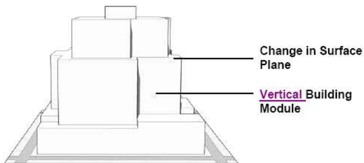
Figure 2 - Massing Articulation