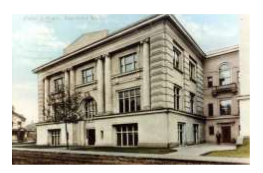
Figure 2. Ann Arbor Carnegie Library and High School (portion), 1907

The AADL system is augmented, based on: (1) the heritage of US libraries going back to Ben Franklin who innovated on US libraries for community access to books the average person could not afford, improving literacy; and (2) Andrew Carnegie who viewed libraries as a key engine for economic development, and financed the first Ann Arbor library on Huron near State Street after the City Council agreed to fund its operation.