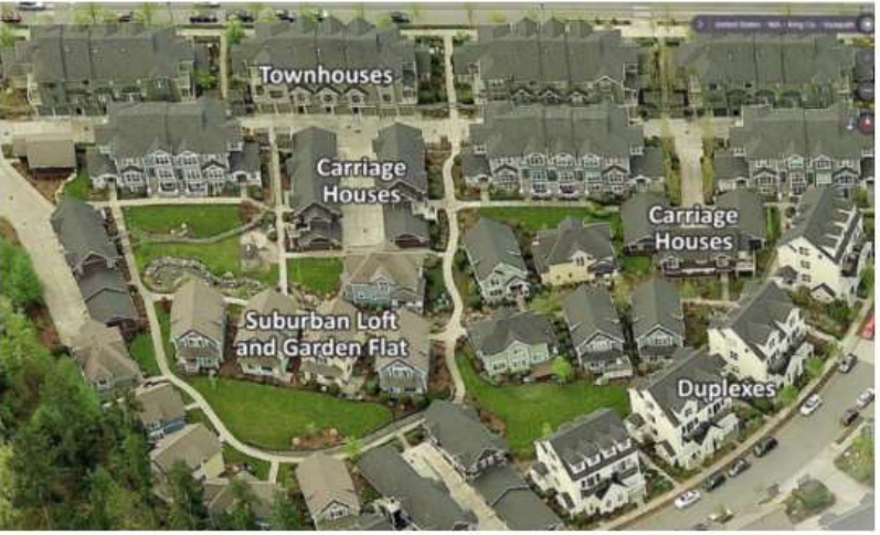
Figure 4. 15 Dwelling Units Per Acre (Gross)

Notable features: A variety of housing types, pedestrian-friendly street frontages, alleys and auto courts, and common open space with trails.