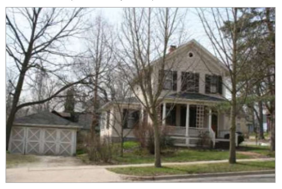
202 S Seventh (2007 Survey Photo)