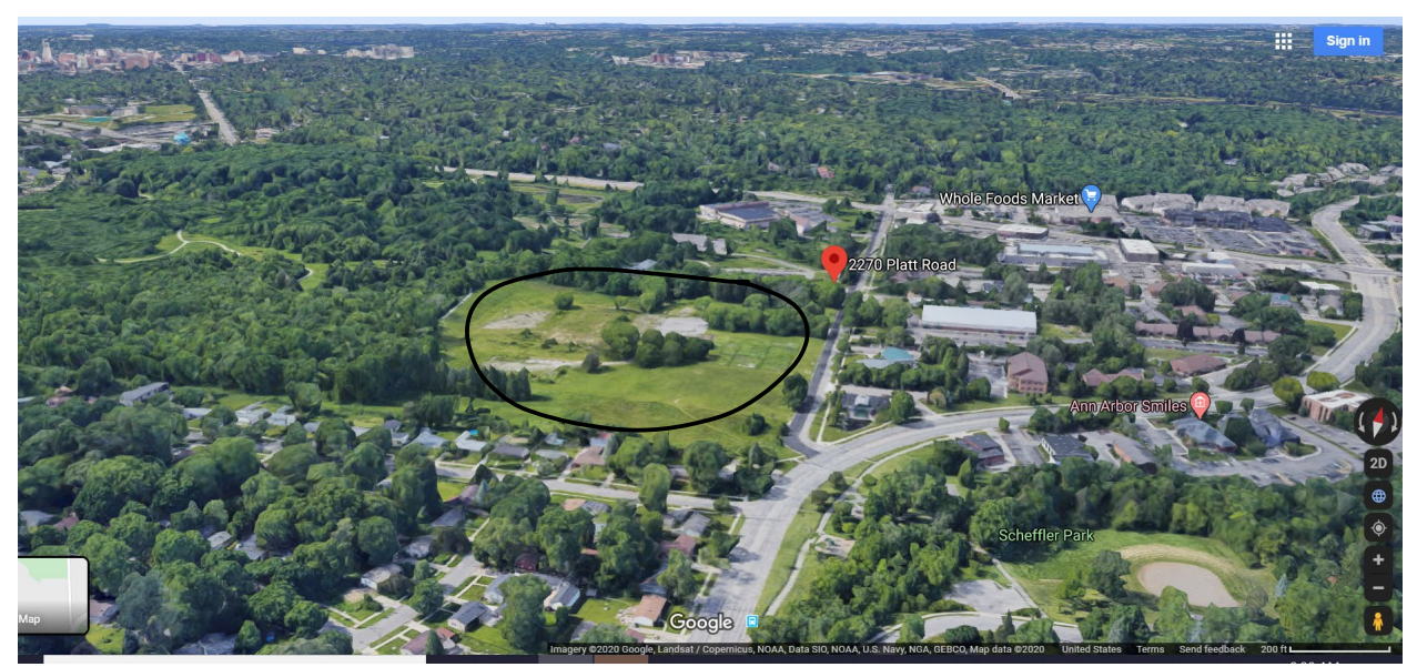
Figure 1 - Bird's Eye View 2270 Platt Road (2020 Imagery from Google)

The site is generally flat with a slight downward slope to the southeast. It is open except for some trees near the former buildings and parking lot, and old hedgerows.