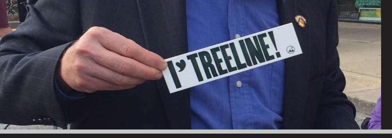
A Treeline bookmark from the Mayor's Green Fair made on an antique letter press.

and Recreation Commission grant program that provides supplemental funding for the development of non-motorized trails. The funds provided to the Treeline are for the completion of an Alignment Study, which is a preliminary engineering study for the N. Main crossing, a significant trail link and the most difficult crossing.