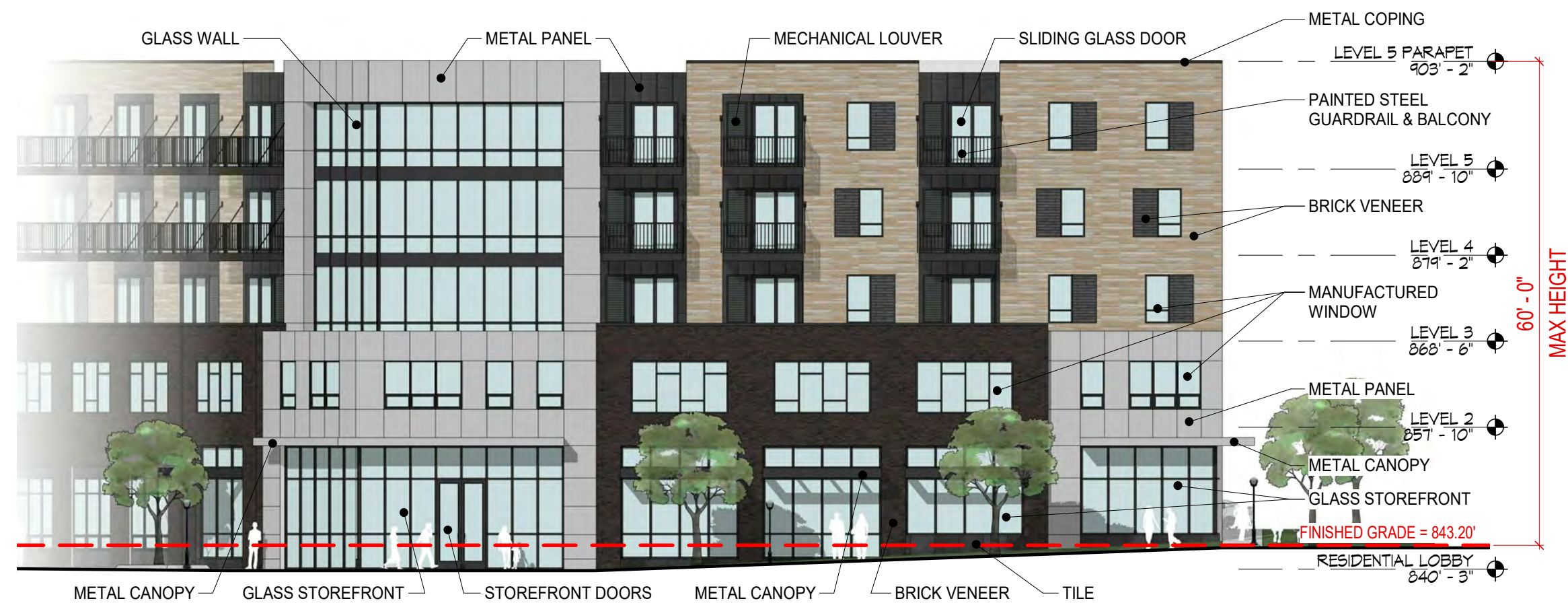
2 PACKARD ST. ELEVATION SP-09 SCALE: 1/16" = 1'-0"