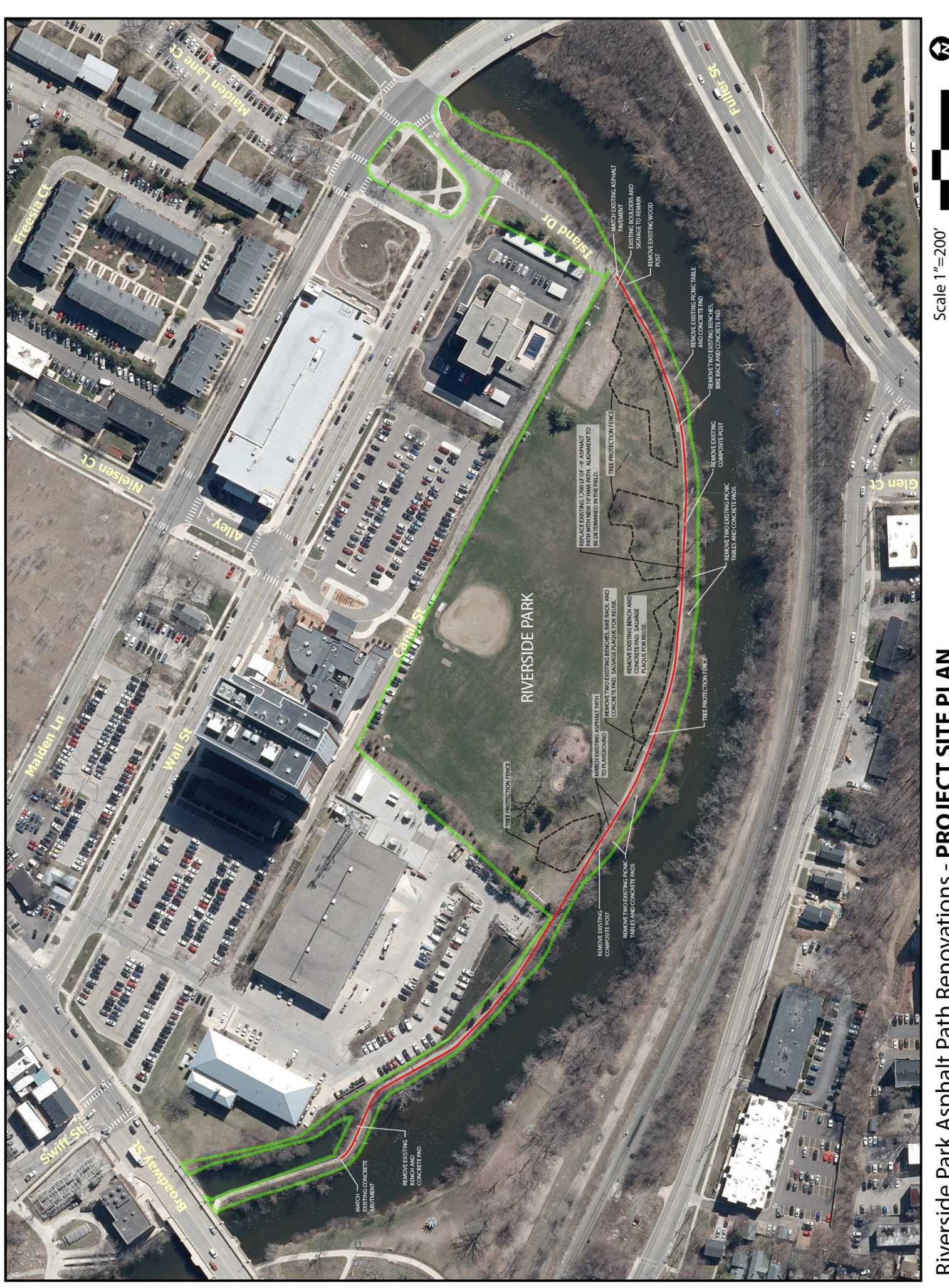
Riverside Park Asphalt Path Renovations - PROJECT SITE PLAN