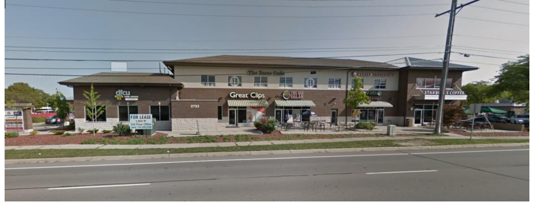
Rear of 2793 Plymouth, July 2015 (google)

Front of 2793 Plymouth, August 2017 (google)