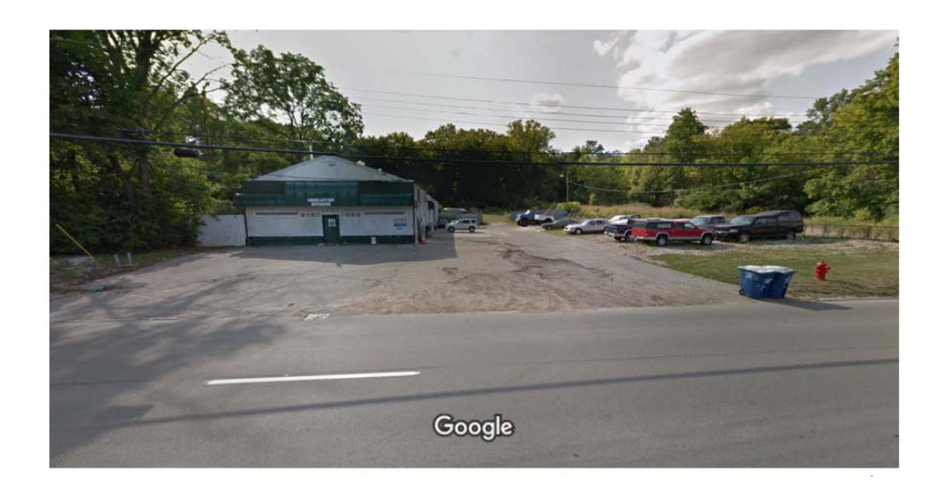
Front of 1251 North Main, August 2017