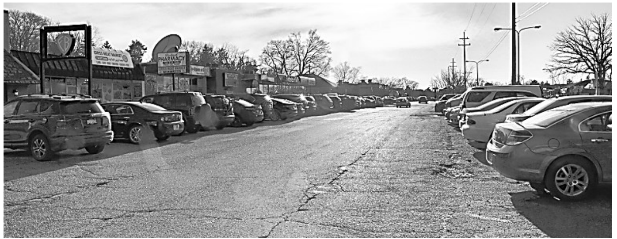
Parking is often already at capacity - 03/30/2018