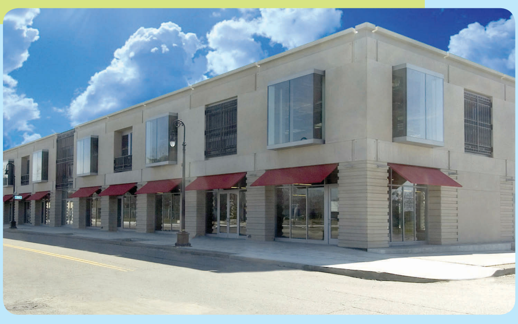
The Detroit Mexicantown International Welcome Center offers information on local and statewide attractions and events.

Recently, several news outlets incorrectly reported that the Detroit Mexicantown International Welcome Center was no longer open for business. Nothing could be further from the truth! The welcome center is open 7 days a week from 9 a.m. to 5 p.m. and offers information on attractions and events locally and throughout the state. The welcome center is located at 2835 Bagley Avenue in southwest Detroit. For more information call 313-962-2360.