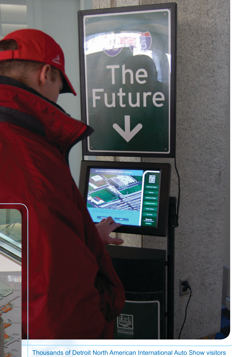
learned about the Gateway Project from the interactive information kiosk on display.