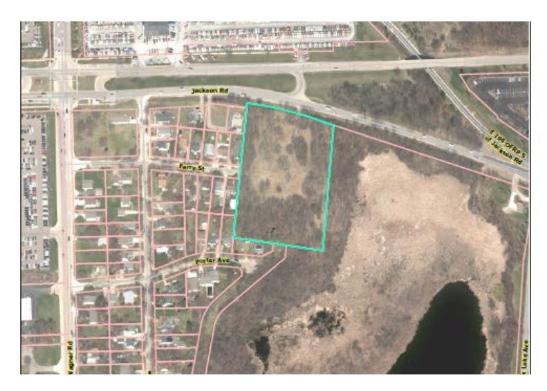
Figure 1: Existing Conditions (2015)

<u>Site Layout</u> – The proposed site plan and additional color renderings show a X-shaped building in the center of the site with parking proposed along the southern and eastern property lines.