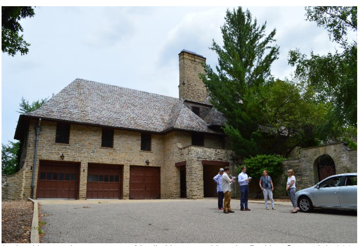
2 - Looking northeast at rear of Inglis House and Interior Parking Court, July 2017