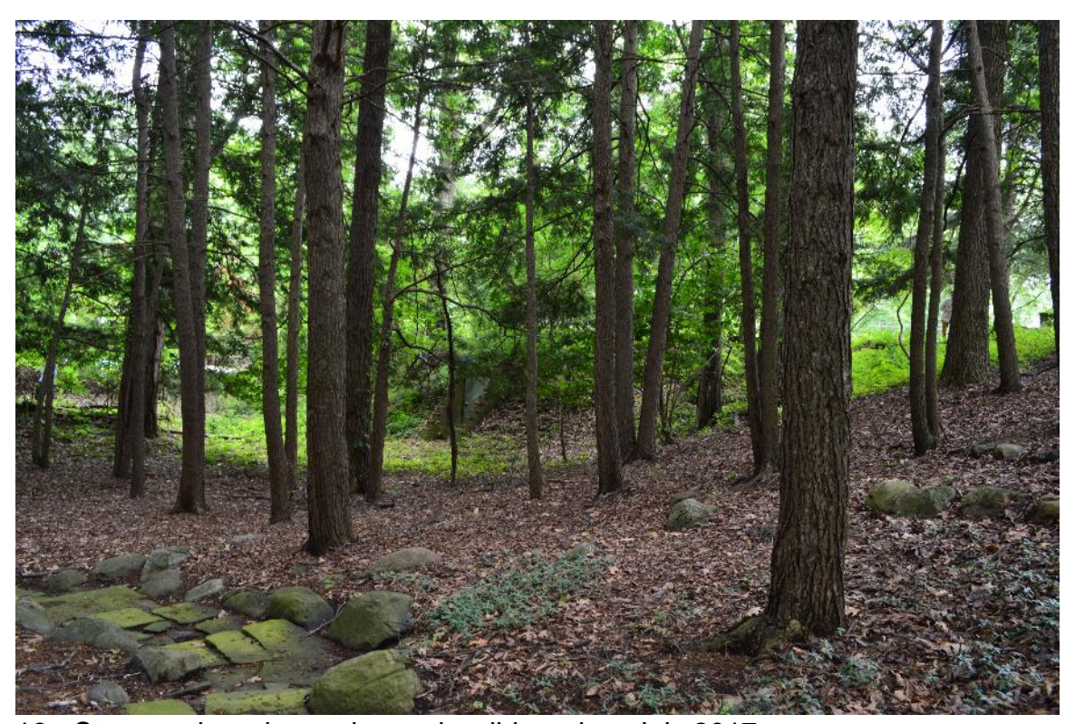
16 - Stone path and pumphouse in wild garden, July 2017