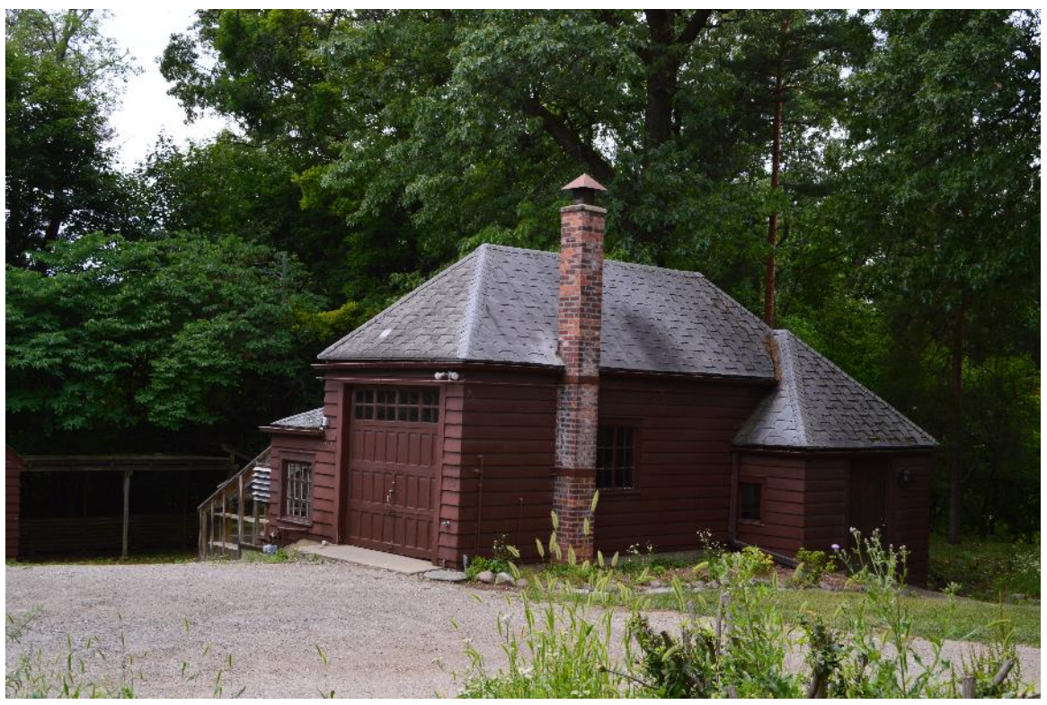
6 - Looking southwest at shop and greenhouse, July 2017