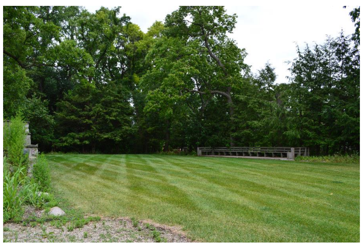
13 - Looking northeast at tennis lawn, July 2017