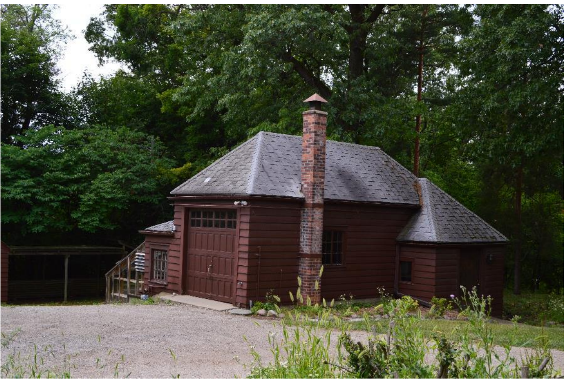
Looking southwest at shop and greenhouse, July 2017