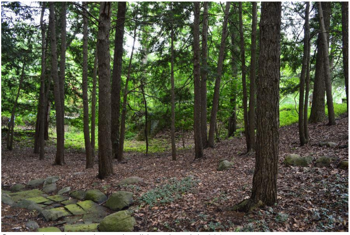
Stone path and pumphouse in wild garden, July 2017