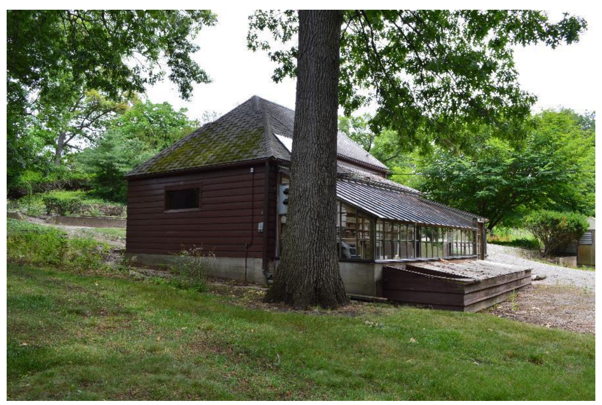
Looking northeast at shop and greenhouse, July 2017