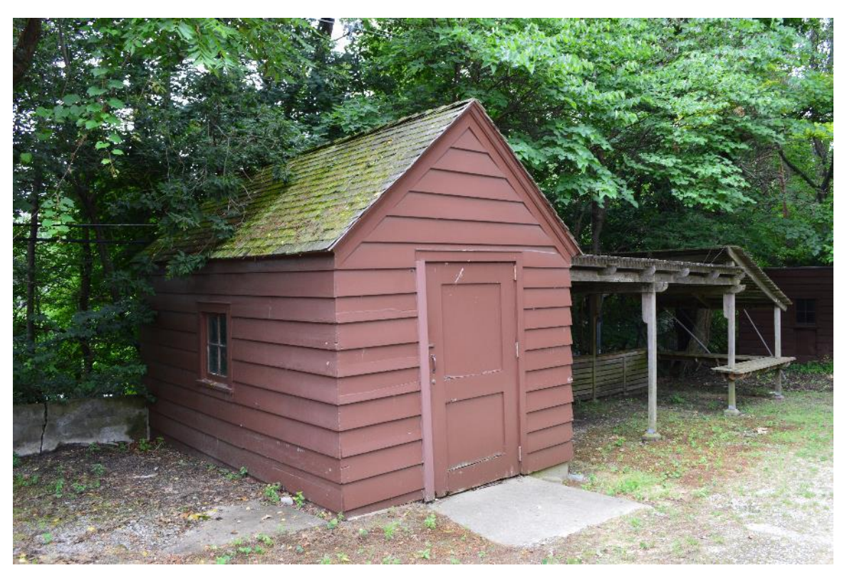
Looking southwest at garden shed and lath house, July 2017