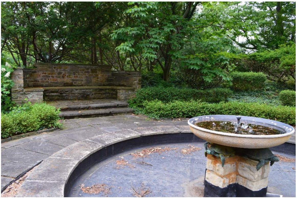
Fountain, turtle sculpture, and bench at south end of formal garden, July 2017