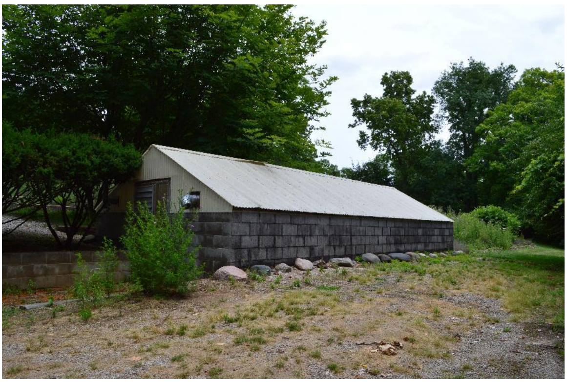
Looking northeast at coldhouse, July 2017