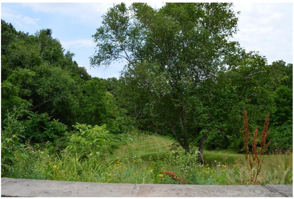
Looking north from oval arrival court out to north lawn, July 2017