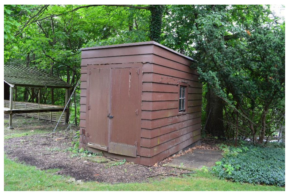
Looking southeast at peacock house/drying shed, July 2017