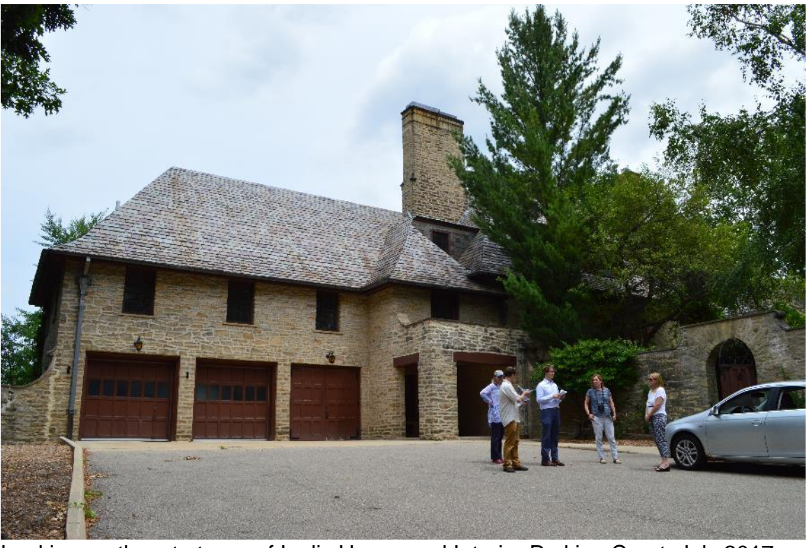
Looking northeast at rear of Inglis House and Interior Parking Court, July 2017