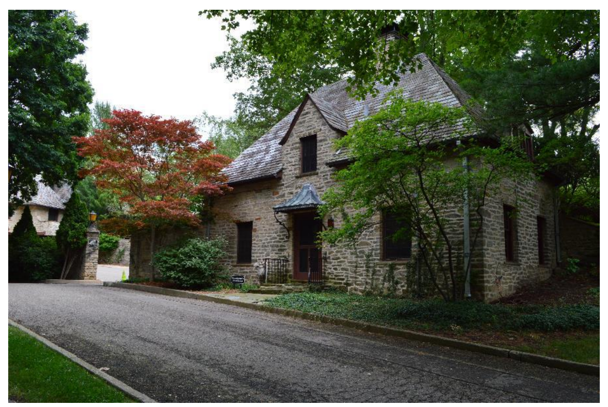
Looking northeast at caretaker's cottage with house to left, July 2017