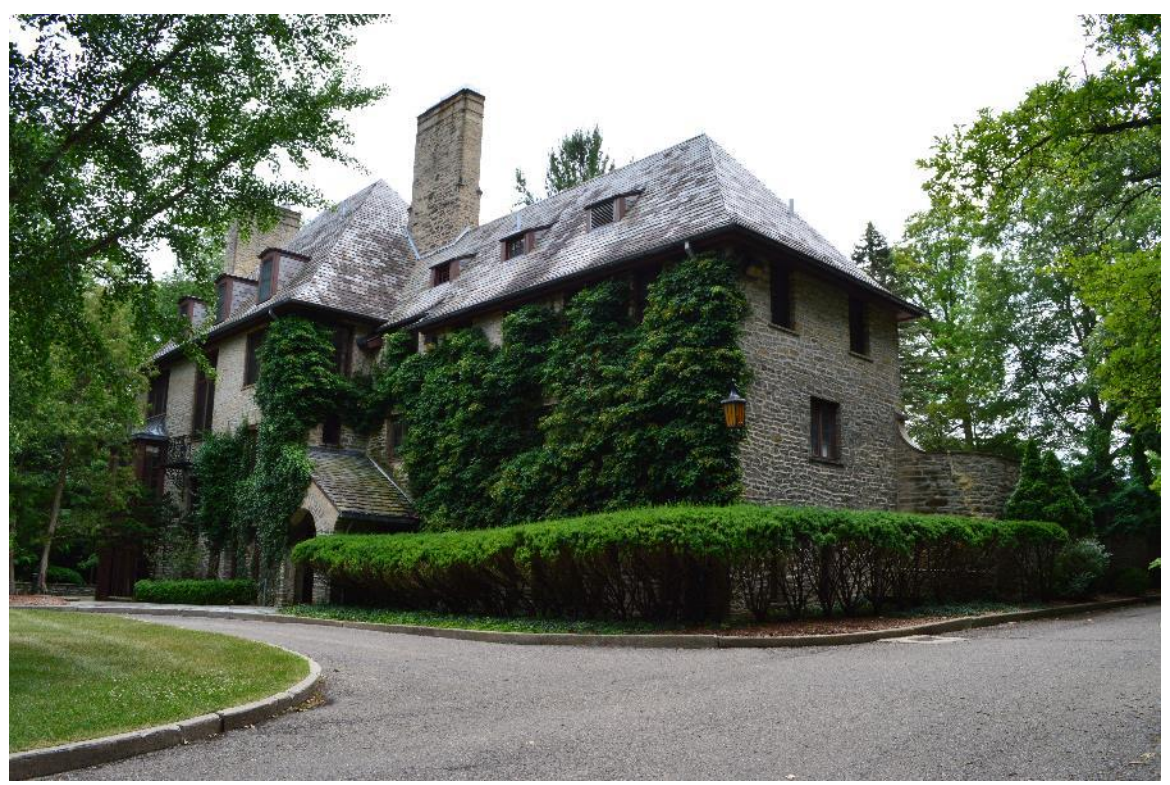
Looking southeast at front of Inglis House and oval arrival court, July 2017