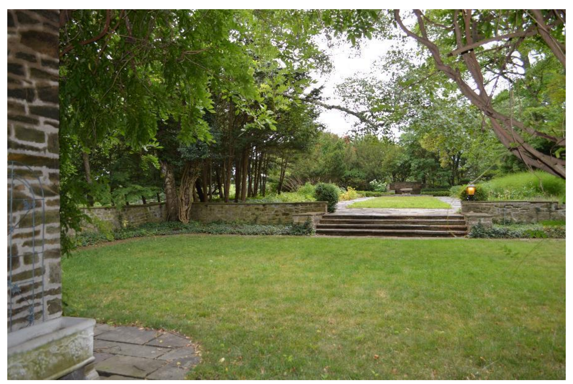
Looking south at south lawn panel and formal garden, July 2017