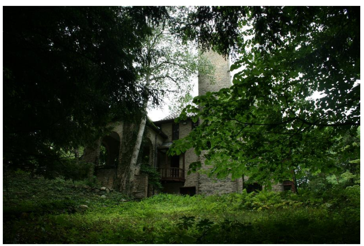
Looking west at wild garden and east end of house, July 2017