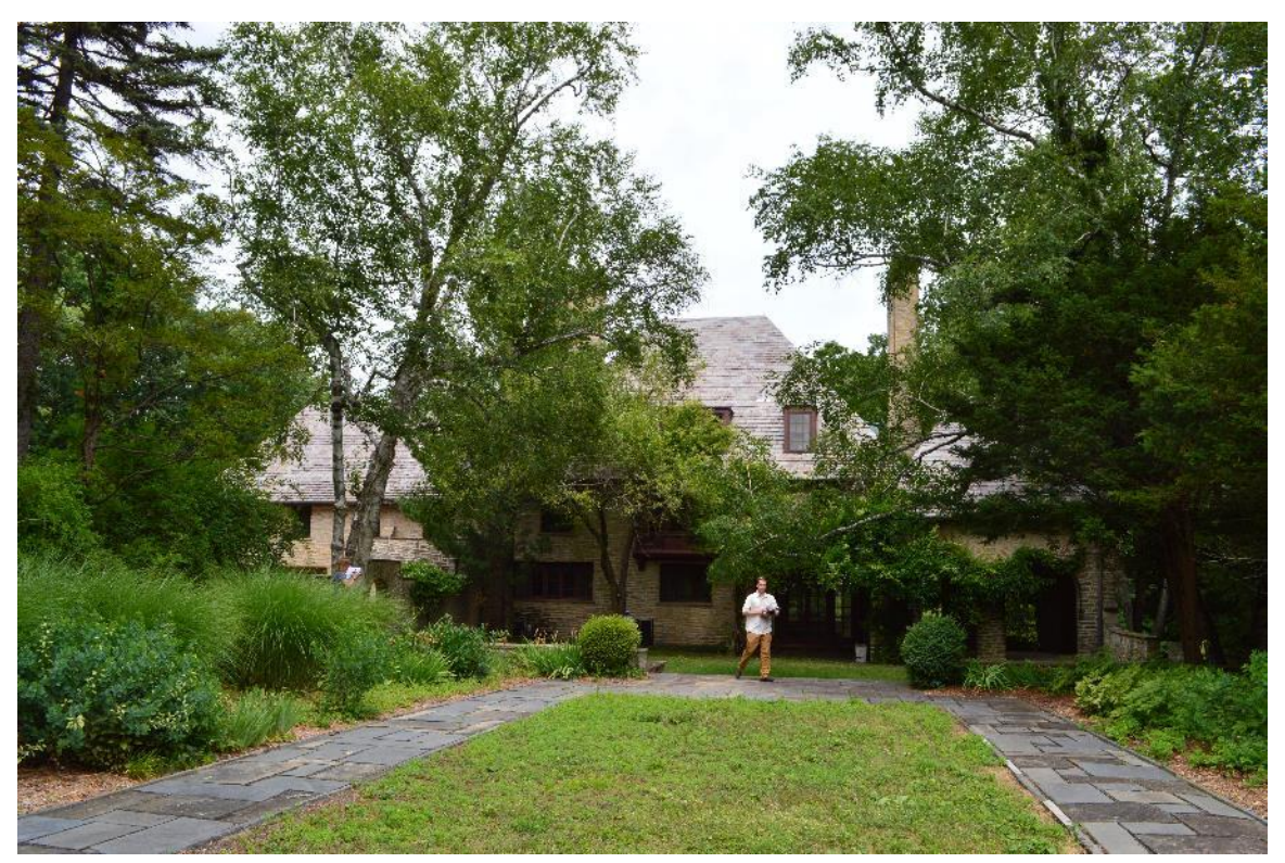
Looking north in formal garden to rear of Inglis House, July 2017