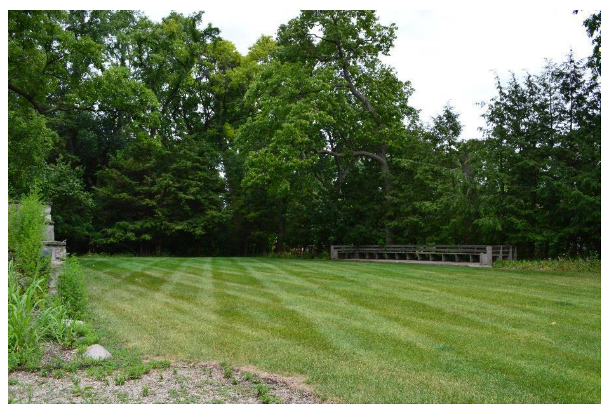
Looking northeast at tennis lawn, July 2017