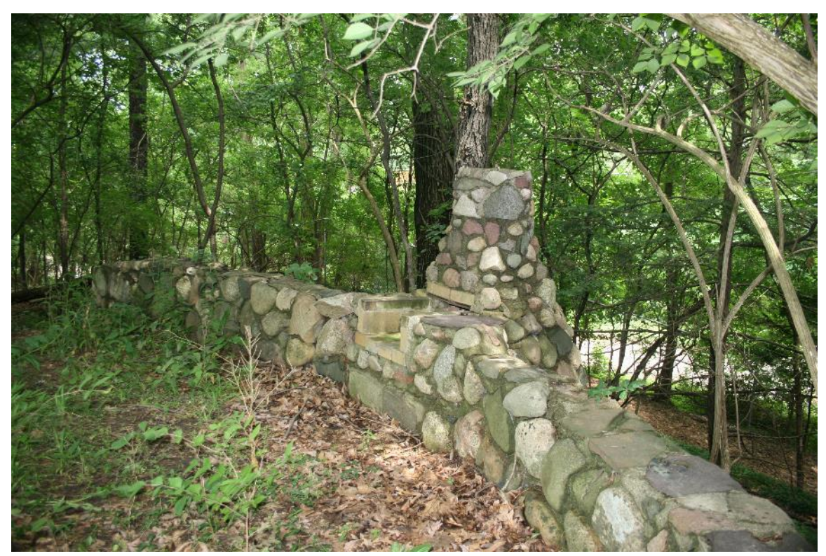
Fireplace built into east wall of wild garden, July 2017