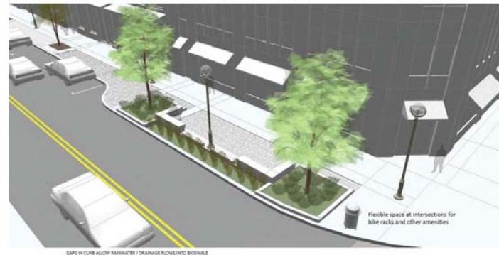
Additional Design Considerations: Widen Mid-Block Sidewalk to Meet Standards