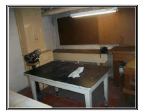
work room in basement