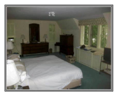
Large master bedroom