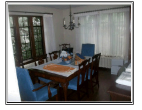
formal Dining room