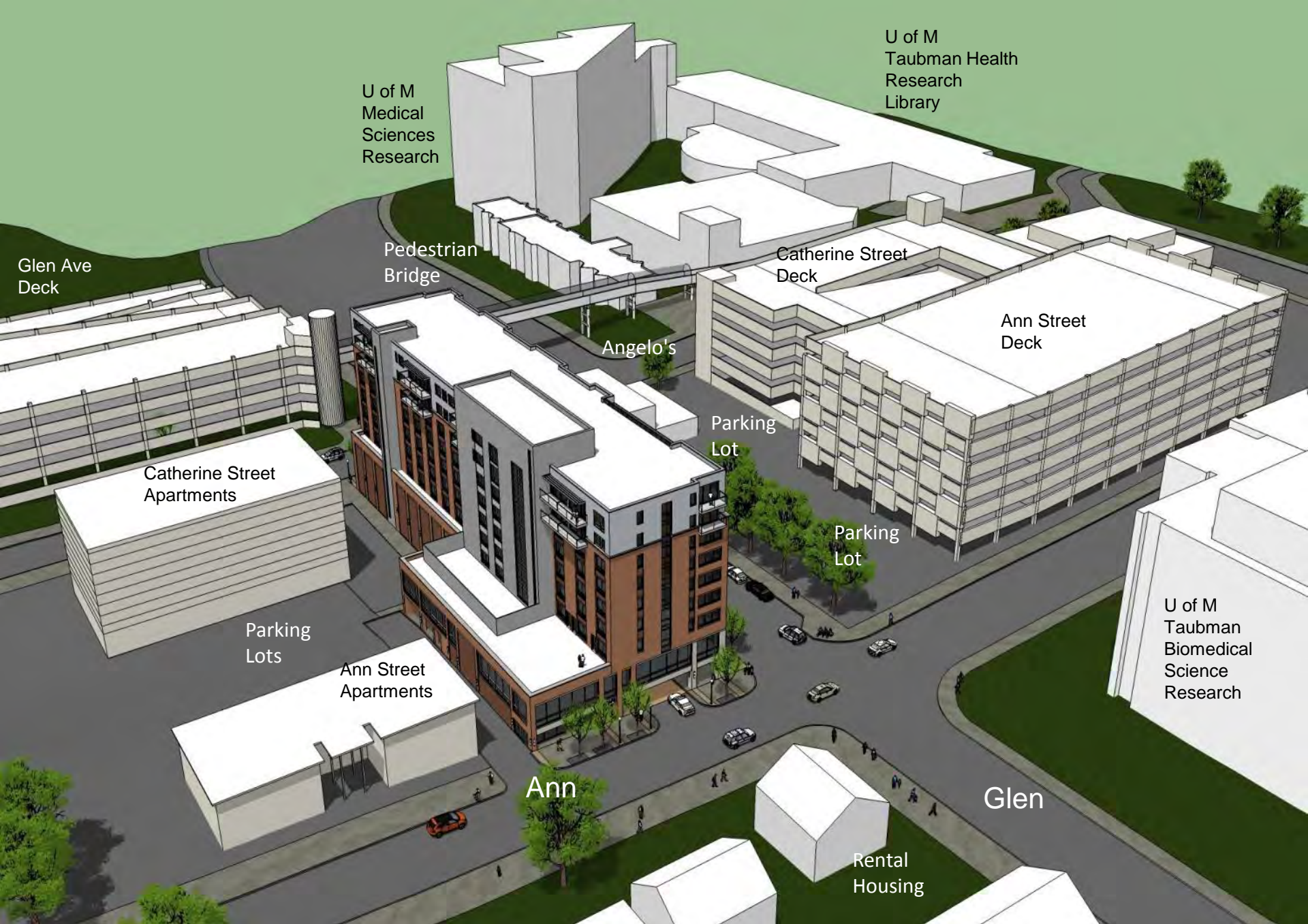
Aerial View of Proposed Hotel looking Northwest