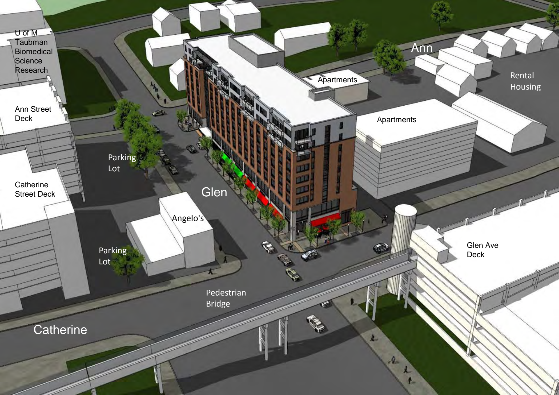
Aerial View of Proposed Hotel looking Southwest